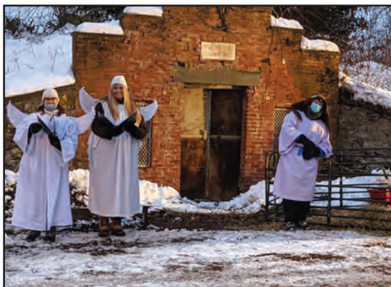
A Living Nativity will be held at Hopewell Reformed Church on Dec. 9 and 10 in East Fishkill.