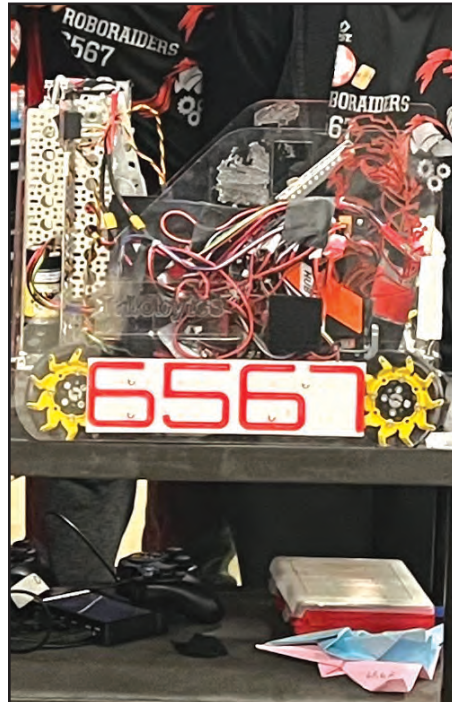
The robot which was entered into the competition by the Red Hook Central Schools RoboRaiders team.