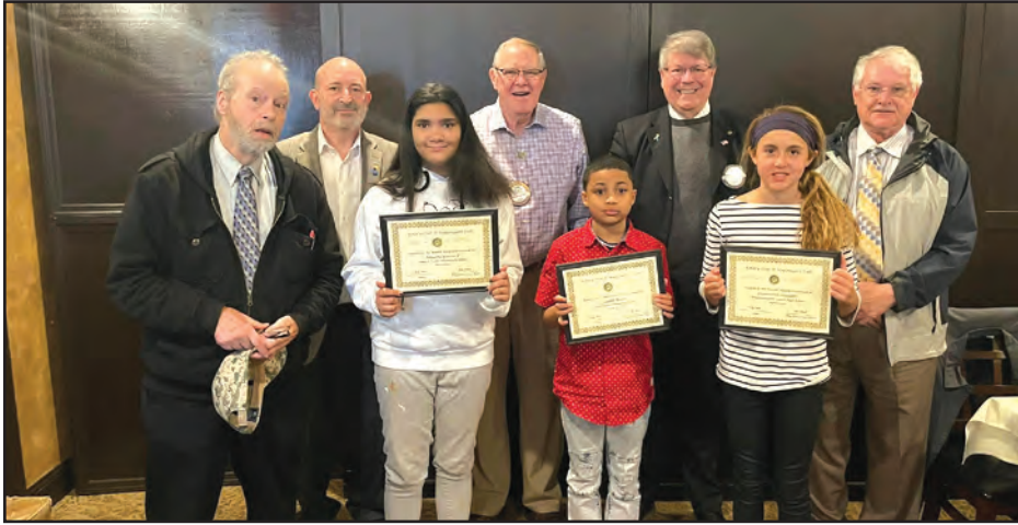
The Wappingers Falls Rotarians recently honored the Students of the Month for April.