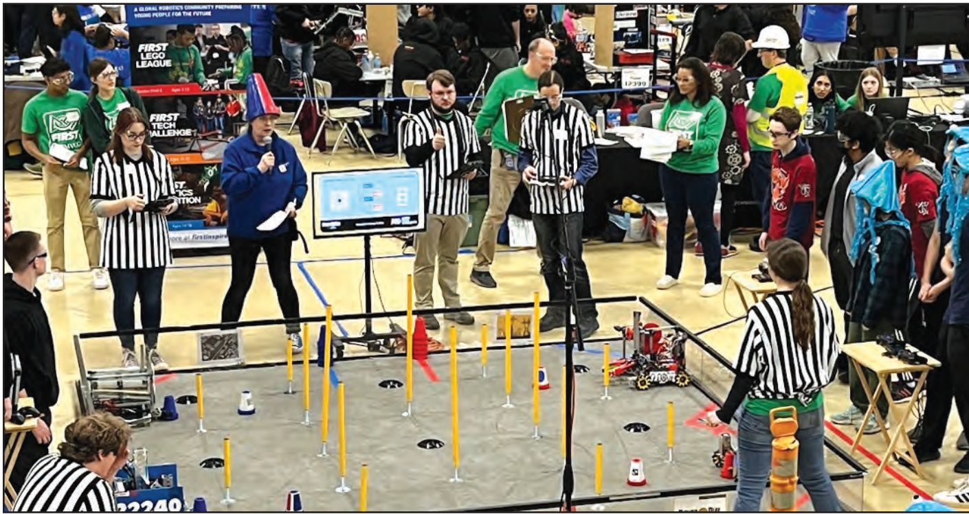
The FIRST (For Inspiration & Recognition of Science & Technology) Tech Challenge (FTC) Robotics Tournament was held at John Jay High School on February 18.