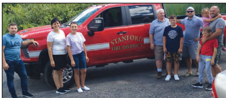
Members of a Ukrainian Church in Syracuse meet with members of the Town of Stanford Fire Department. The Stanford Fire Department is fulfilling its effort to ship over 3,000 pounds of firefighting and medical equipment to a village in war-torn Ukraine. Fire departments from all across Dutchess County assisted with donations of equipment.

The head of the Stanford Fire Department's 9-11 Committee and his colleagues were emotional after months of hard, and a times frustrating, work to collect much-needed fire equipment and supplies for a village in war-torn Ukraine. When the group traveled from the small Dutchess County