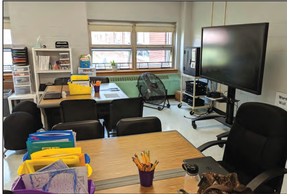
The Beacon City School District 2022-23 school year began for students on September 6.