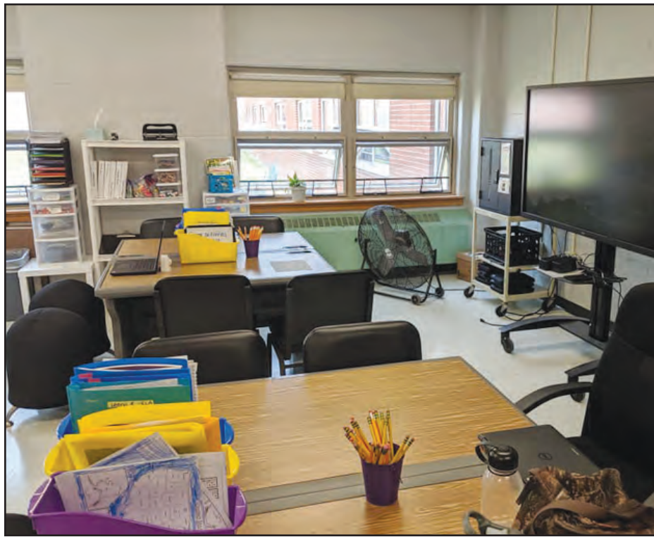
The Beacon City School District 2023-24 school year began for students on September 5. The Wappingers Central School District started September 6.

The District has made necessary capital improvements to the infrastructure of its 15 school buildings and grounds, stated Bonk. "We continue our collaboration in the area of school safety and mental health services with Dutchess County