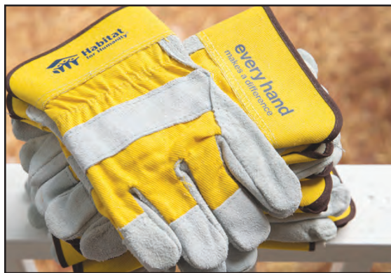
The Town of Poughkeepsie will be working with Habitat for Humanity of Dutchess County on a community service project to commemorate 9/11.

Anyone who wants to volunteer may contact Habitat of Humanity of Dutchess at 845-297-0806 or email Volunteers@habitatdutchess.org .