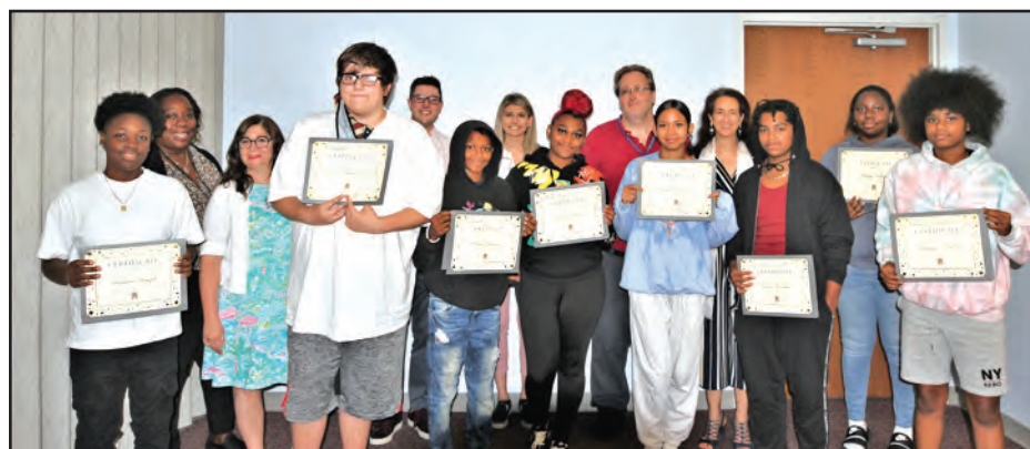
Local students, seen here with their mentors, successfully completed the County's financial and computer training program.

This program has been recognized as a best practice for youth job preparation and was showcased at the 2015 summer conference of the New York Public Welfare Association. The program is funded through the Temporary Assistance for Needy Families program and the Foster Care Block Grant.