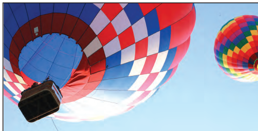
The Hudson Valley Hot-Air Balloon Festival will take place at Tymor Park from September 2-4.