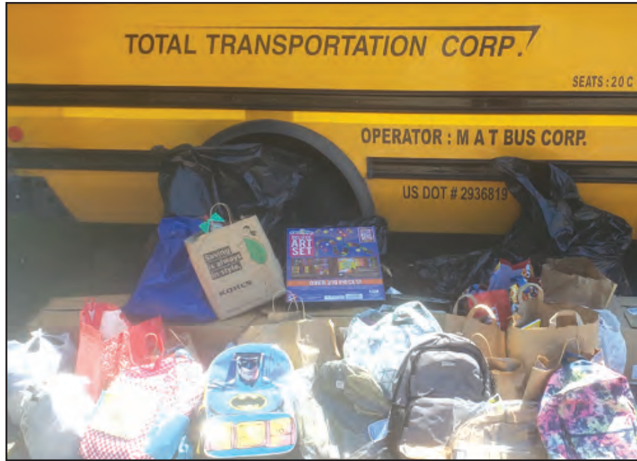
Local residents dropped off school supplies and backpacks to help victims of the floods in Kentucky.