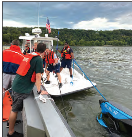
Firefighters retrieve a jet ski from the Hudson River.