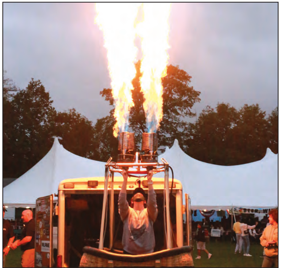
The Hudson Valley Hot-Air Balloon Festival will take place at Tymor Park from September 2-4.