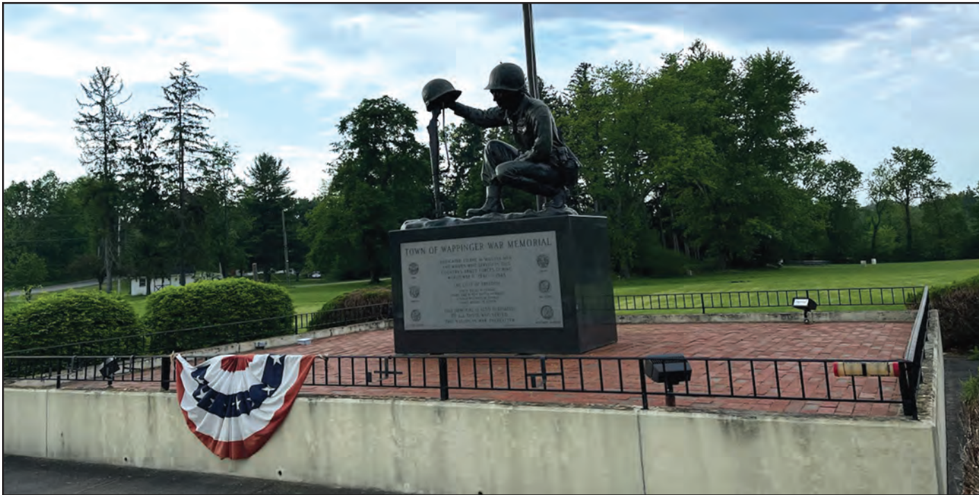
The Town of Wappinger will host its annual Memorial Day Remembrance Service on May 30 at 2 p.m. at Brexel Schlathaus Park in Wappinger.