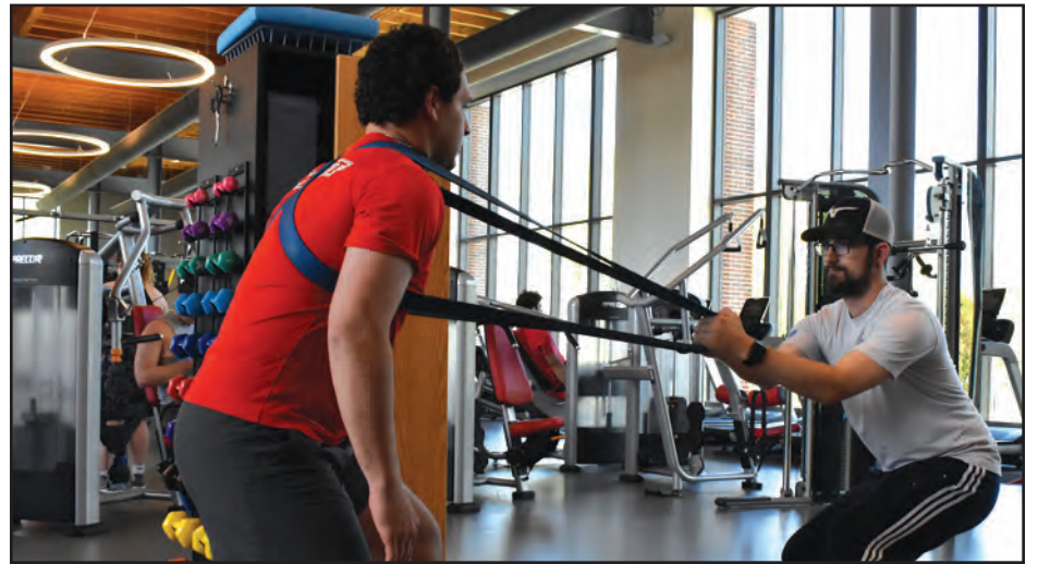
There is over 5,000 square feet of space for running analysis, throwing techniques and jumping in the new Center for Physical Therapy sports injury facility at Marist College. Adjustable tables and a private room for examinations and treatment are also available.

If you have any questions or would like to schedule an appointment, please call 845-297-4789 to inquire about Center for Physical Therapy's Marist College Program.