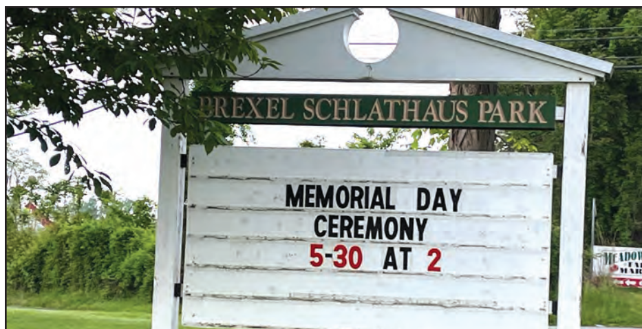
Local municipalities will host Memorial Day commemoration. The Town of Wappinger will host its annual ceremony on May 30 at 2 p.m. at Brexel Schlathaus Park in Wappinger.