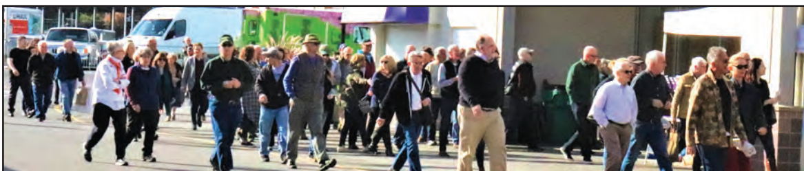
Crowds stroll the walkways to three well-ventilated buildings at the Dutchess County Fairgrounds for the Spring Antiques at Rhinebeck Show.