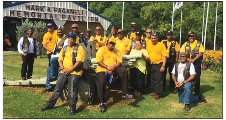
Members of the Hudson Valley Buffalo Soldiers Motorcycle Club convening at the Poughkeepsie VFW during the summer of 2019.

If you are a biker, you will definitely want to check out these upcoming events. But even if you are not, you might want to support one of these events anyway and enjoy some great barbecue and music and