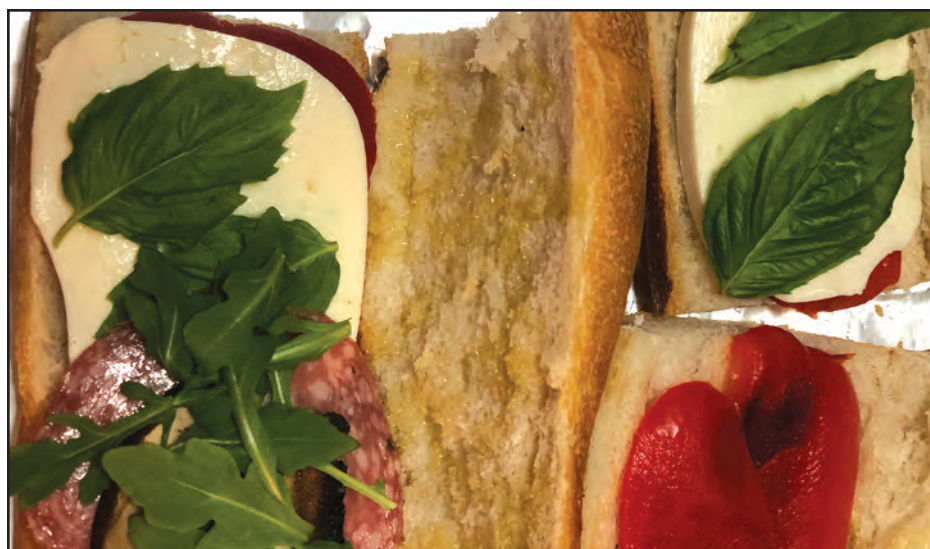
These picnic sandwiches can be made a day in advance.

So, this year I made sandwiches to fill that particular need. I wanted to share them with you because they are perfect for all the outdoor living, you're sure to do this time of year. From picnics to hikes, these fit the bill. Made ahead of time and without anything overly perishable, they pack well and are better if made the day before. They're also pretty healthy and will satisfy without leaving you so stuffed that you need a nap. You'll get flavor and the energy you need to fuel adventures of your own. They are, quite possibly, the perfect take-along meal.