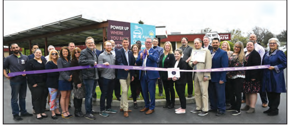
Ulster Savings Bank's ribbon-cutting event for the new EV solar charging station at its Kingston location.

Other green projects in the works is an additional EV solar charging station for employees at the main headquarters in Kingston and one for their New Paltz location. Last year, the bank installed solar panels at its Red Hook and New Paltz branches and this year will be