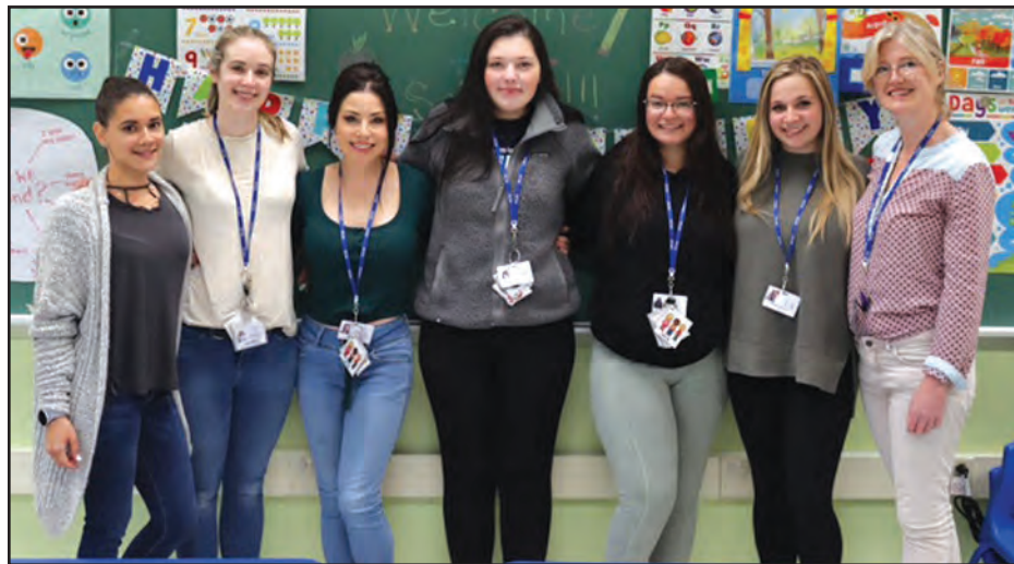
Preschool team members in Stanfordville at Cold Spring Elementary School are part of the Anderson Early Learning Academy.