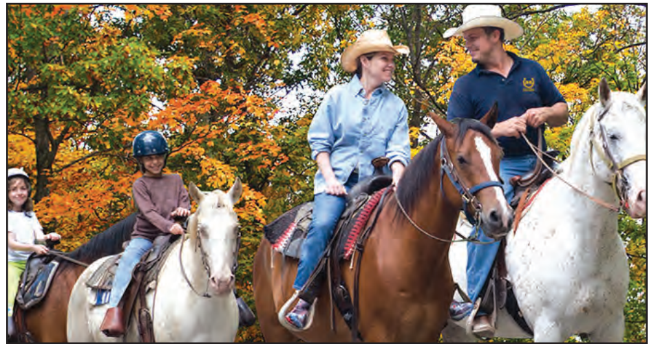
Rocking Horse Ranch in nearby Highland offers horse-back riding for the whole family, plus a variety of other exciting activities.

Arizona is host to some of the best-known trails. While most hikers are familiar with Grand Canyon, especially the Bright Angel Trail, there are many lesser-known options in the state. You can find multiple trails in Sedona, Coconino National Parks. Colorado is also known for a multitude of hiking trails and will likely have fewer visitors than Arizona.