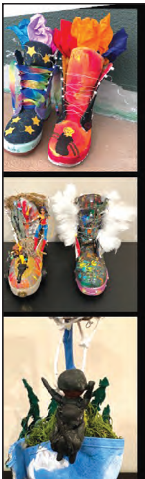
These military boots have been re-imagined into sculptures in an art installation, "March A Mile In My Boots," on display at the Pleasant Valley Library through May.

The artists were able to unpack different aspects of their identity including values important to them, their family and community, personal interests, experiences, supports, goals, coping strategies, etc. and to then connect these ideas to colors, images, materials and symbols. Saints & Scholars, Inc., an art-based non-profit organization, facilitated this art-making workshop.