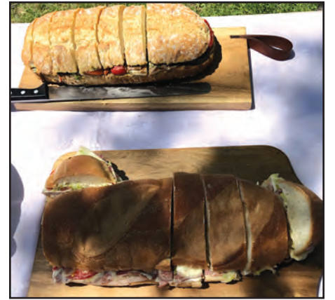
Sandwiches are perfect for a picnic meal.

Oh, and don't be afraid to pile on those toppings or even repeat layers! There's a good amount of bread to balance out, so as long as you can fit it in your mouth, you're good to go! It's also a good idea to bring along some extra condiments just in case. I brought the balsamic glaze, the Greek dressing and more pesto mayonnaise, as well as some mozzarella, tomatoes and roasted pep-