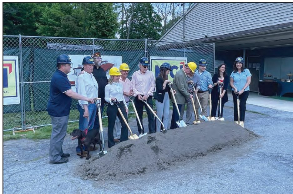
The Dutchess County SPCA broke ground on May 12 on a renovation project that will transform its clinic and create new dog kennels. Local officials participate in the ceremonial groundbreaking.