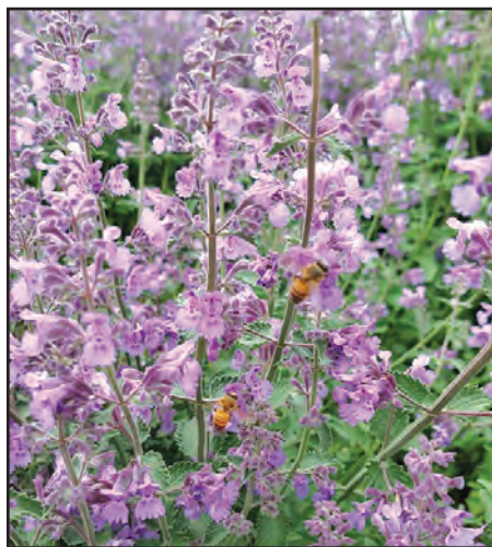
Catmint with honeybees.

Two miles – that's quite a distance to cover, but I couldn't let Joe down. I just had to find out where those bees were dining. Off I went into the neighborhood. Honeybees love apple blossoms, crab apple, Japanese cherry, and lots of other spring blooming trees. But they were all out of bloom by mid-May. And the summer favorites like daisies, coneflowers, lavender, zinnias and sunflowers, not to mention fall blooming asters and goldenrod, were nowhere in sight. As I traipsed down the road, waving to the neighbors as I inspected their gardens – "Just looking for bees!" I struck out on the roses, irises, even the baptisia, which is supposed to be a favorite. A few azaleas were still in