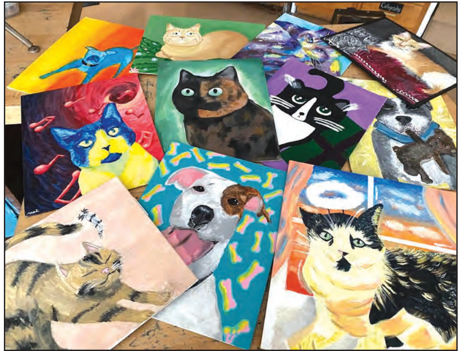
Some of the paintings that will be auctioned off during the HeART of the Shelter Artists' Reception on May 27 in Beacon.

The 18 paintings are on display at Bank Square Coffeehouse, 129 Main St. in Beacon.