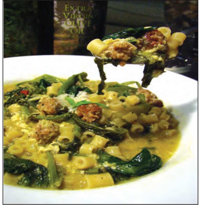
A bowl of Italian wedding soup.

1 small onion, grated 1/3 cup chopped fresh Italian parsley 1 large egg