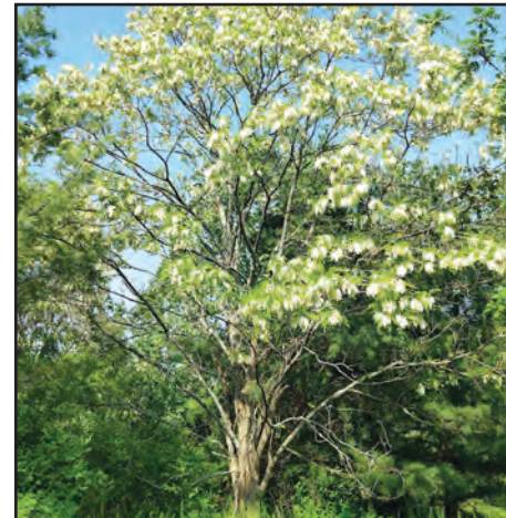
A black locust in bloom.