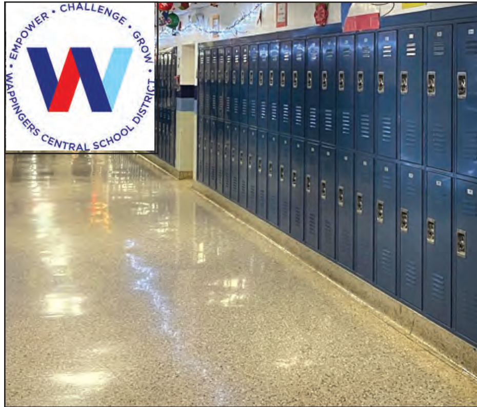
Registered voters in the Wappingers Central School District will vote on the 2023-24 Budget Vote on May 16.