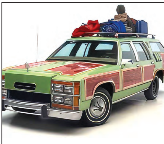
One of the celebrity vehicles expected at the Rhinebeck Car Show is the iconic "Truckster" from "National Lampoon's Vacation" movie.