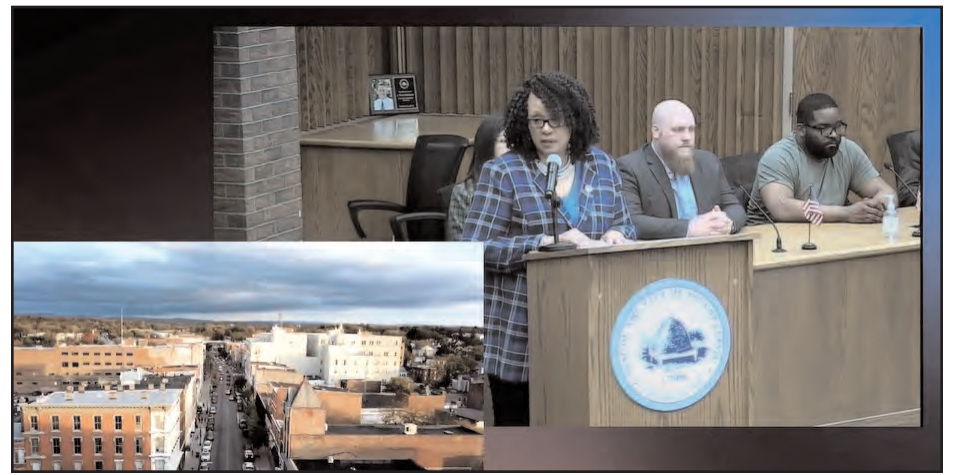
City of Poughkeepsie Mayor Yvonne Flowers stated during her State of the City address that the city has “wiped out what once was a $13.2 million general fund deficit and now has developed a fund balance -- major accomplishments for the city.”

“The Governess,” a gastropub that will feature a variety of American cuisine. ESS already has two established restaurants -- “The Baroness” and “The Huntress,” both in Queens. These establishments have a strong following, and ESS Hospitality has ambitious plans to tie their new Poughkeepsie