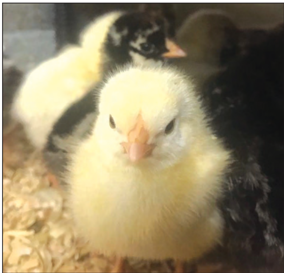
Baby chicks of many different varieties are available at Hackett Farm Supply in Clinton Corners.