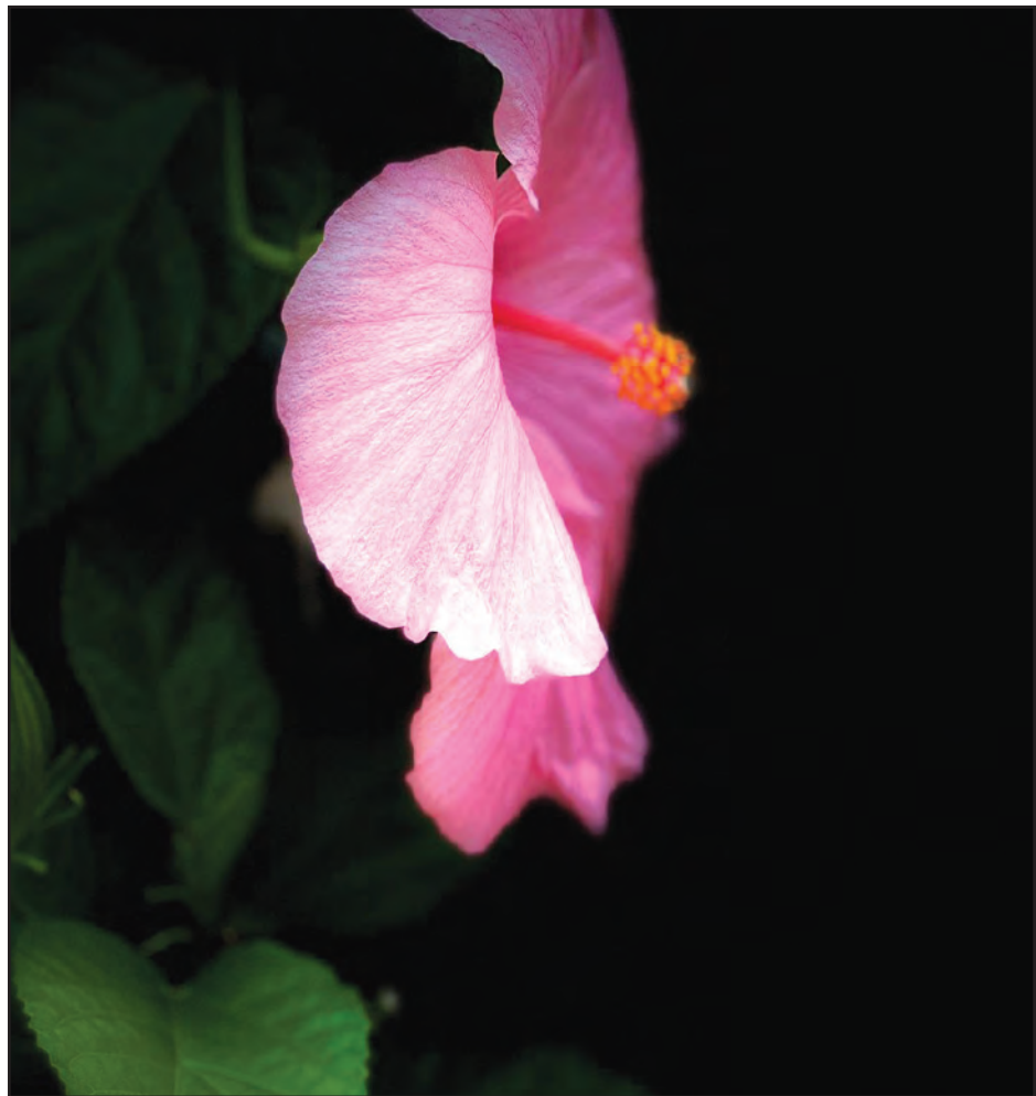
Pictured, from left, are "Beach Rose" and "Angel Wings" by Phyllis Chadwick.