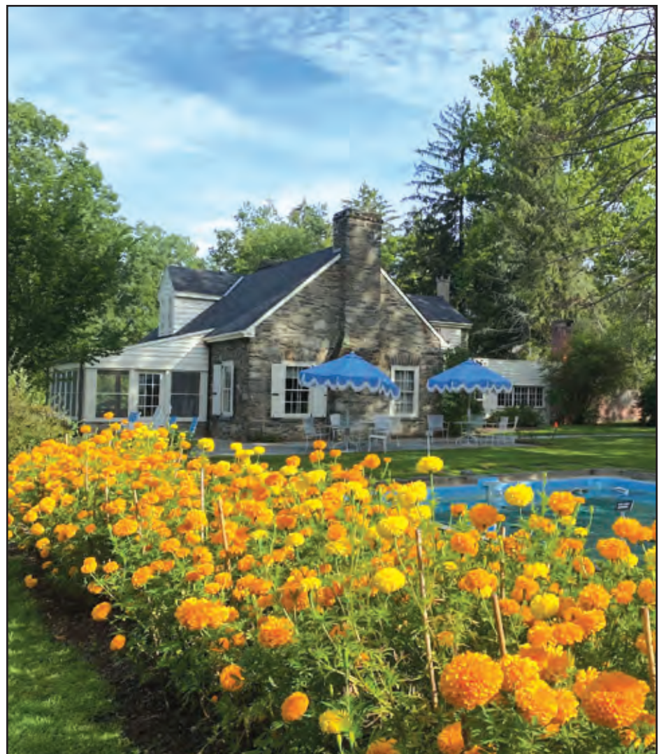
Val-Kill, the Home of Eleanor Roosevelt, in Hyde Park.