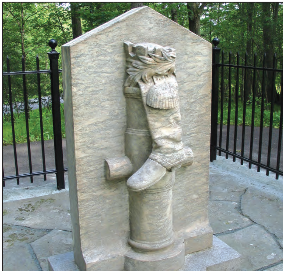
The Boot Monument at Saratoga National Historical Park.