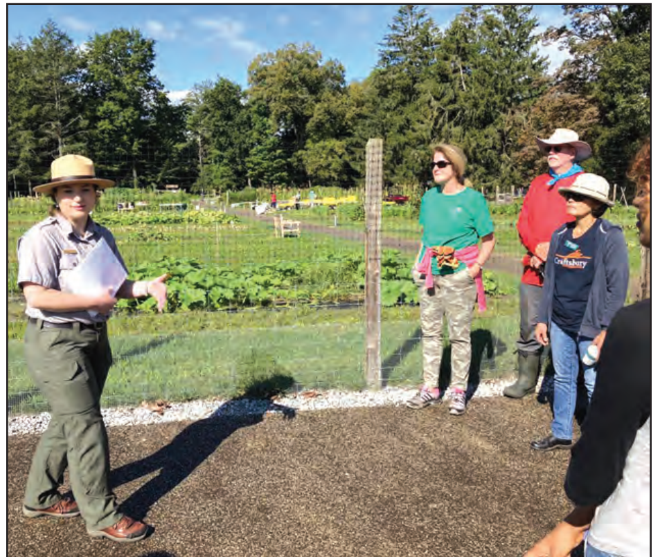
Ranger tour of some of the gardens

The National Parks belong to you, so don't wait for a road trip west to find your park. Check out one or all of these opportunities in 2024, and take advantage of the free, daily access to history, recreation, nature, and education that lies in your own backyard.