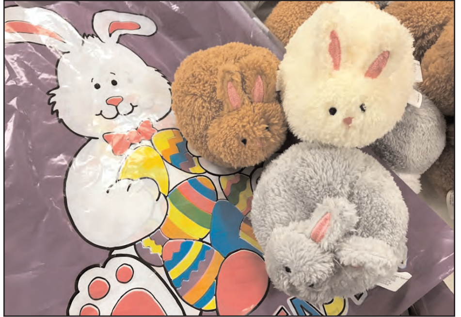
The East Fishkill (After) Easter Egg Hunt will be held on April 6 at the East Fishkill Community Center.