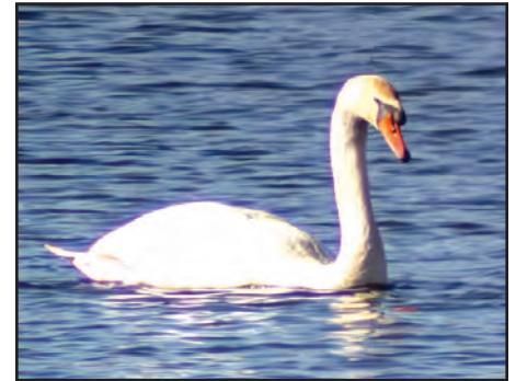
Pictured at left are a Mute Swan on Wappinger Lake and above Mute Swan on Freedom Road Pond in Pleasant Valley.

their forehead. Neither Trumpeter nor Tundra Swans have these features. The neck of Mute Swans looks like half a heart when viewed in profile. Mute Swans are larger than Tundra Swans, but slightly smaller than Trumpeter Swans. Trumpeter Swans sometimes have pink coloration around their mouths. Their necks are “C-shaped.” Tundra Swans have yellow between their eyes and the upper base of their beaks. They hold their necks vertically.